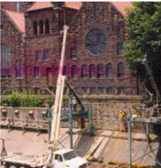
A retaining wall in Kentucky was stained after curing to create a more natural look.

Soil and rock nailing is a relatively new construction technique first used in Europe to stabilize