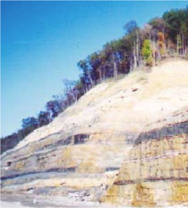
A retaining wall in Kentucky was stained after curing to create a more natural look.